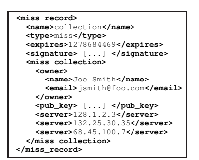
Figure 3: Example master record.

ble (DHT) that stores a mapping of the collection identifier to the particular MISS server(s) on which the records are stored in a master record. Therefore, to retrieve a metainformation record the missd first queries the DHT with the collection identifier to retrieve the master record-as denoted by the double-arrowed line in Figure 2. An example master record is shown in Figure 3. The record starts with the four standard fields (name, type, expiration time and signature). Next, the collection information is enumerated, including the collection owner's name, email address and public key. Finally, there are a list of MISS servers which hold the records in the collection. Once the MISS server(s) for a given collection has been identified, the client queries one of the MISS server directly for particular records within the collection-shown with the two dotted lines on the figure. Each record is identified by a three tuple (c, t, n)where c is the collection identifier, t is the type of record and n is the name of the record. It is presumed the servers will be queried in the given order, however, to support loadbalancing the record may include additional information to better direct the missd 's choice (e.g., an indication to choose a random server).